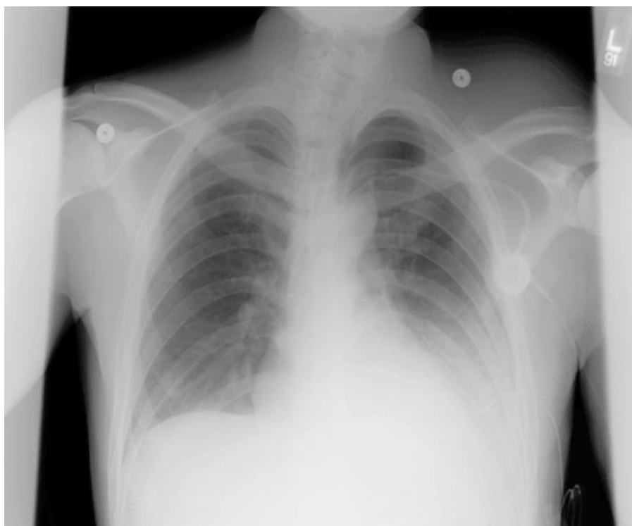
Fig. 3. AP radiograph of the same patient as in figure 2 after the insertion of a PC and first drainage of 1,200 ml of bloody effusion. The PC can be seen first along the diaphragm and then along the left heart border.

to death was 26.3 days (range 15–49 days). None of these patients died from respiratory failure related to reaccumulation of the MPE.