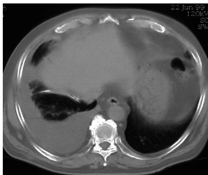
Fig. 4. Chest CT of a patient with a PC in place.

Nineteen patients (21 PCs) survived either to the time of PC removal or to the time of this analysis. Ten patients (53%) achieved effective pleural symphysis by using daily PC drainage. The mean duration of time required to achieve pleurodesis by PC-directed MPE drainage was 39 days (range 7–85 days). One patient achieved partial pleurodesis 15 days after PC placement. Although complete pleurodesis was not achieved, the patient's symptoms improved and the PC was removed. Therefore, we were able to achieve complete or partial pleurodesis and symptomatic relief of MPEs in 11 of 19 patients (58%) without the insertion of a standard chest tube or the instillation of sclerosing agents. Four patients (4 PCs) had had functional PCs in place for a mean of 49.8 days (ranging from 16 to 105 days) at the time of this analysis. Most notably, all patients, including those who did not achieve complete or partial pleurodesis, experienced significant relief of respiratory symptoms after placement of the PC. None of the ten patients who achieved complete pleurodesis showed any evidence of MPE recurrence. The patient with partial pleurodesis ultimately expired due to causes unrelated to the minimal reaccumulation of pleural fluid.